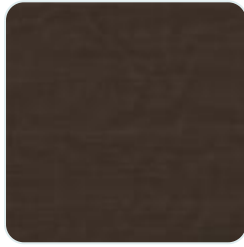
Wenge oak look