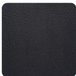
Nappa black leather