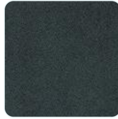
Black caviar look