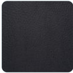
Nappa black leather